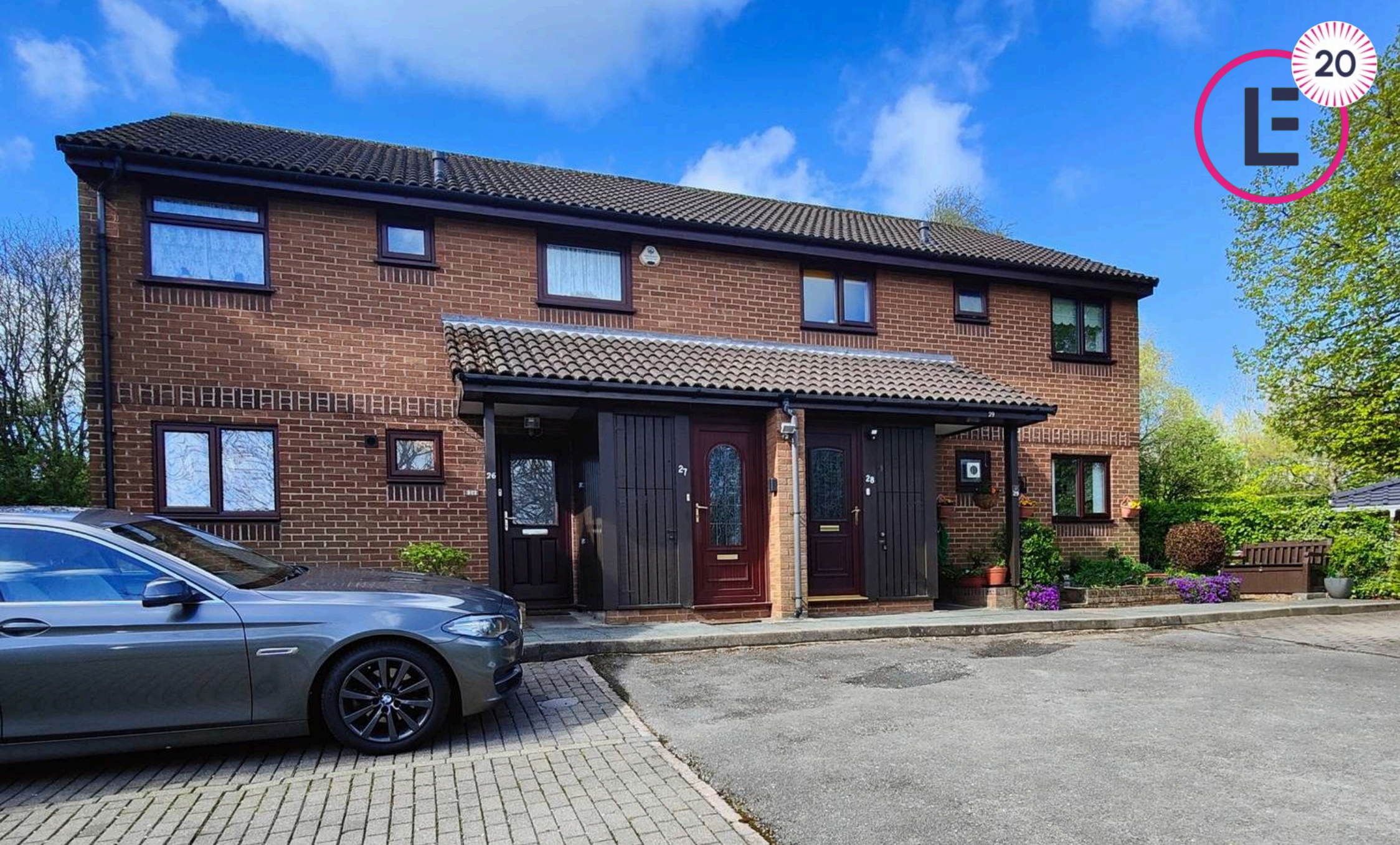
26 Lancambe Court, Lancaster Lancaster