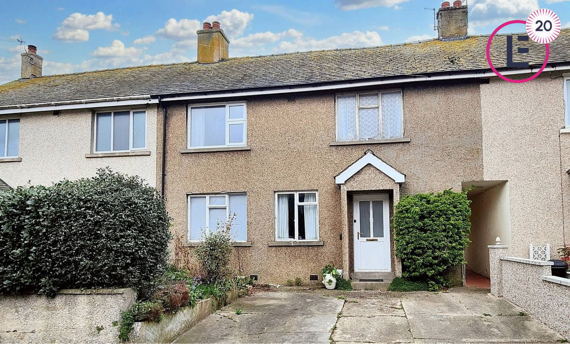
6 Bowland View, Glasson Dock Lancaster